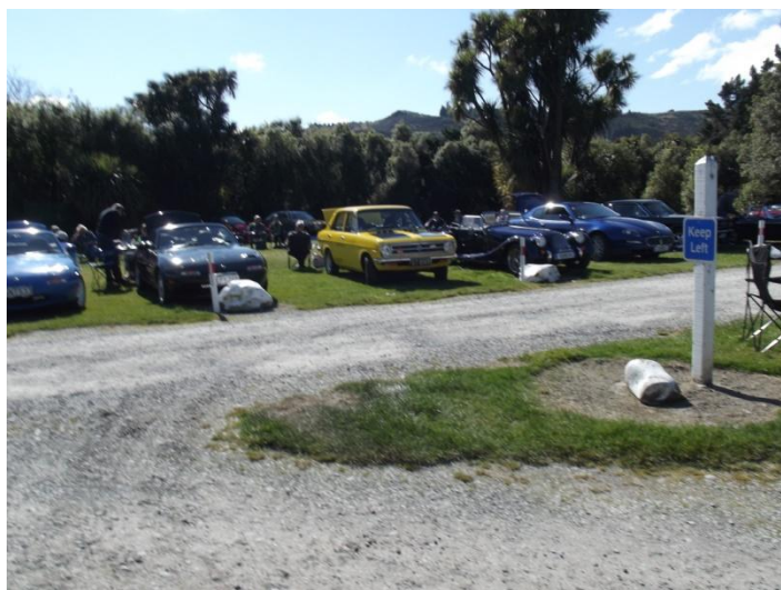
Lunch Time at Rakaia Gorge