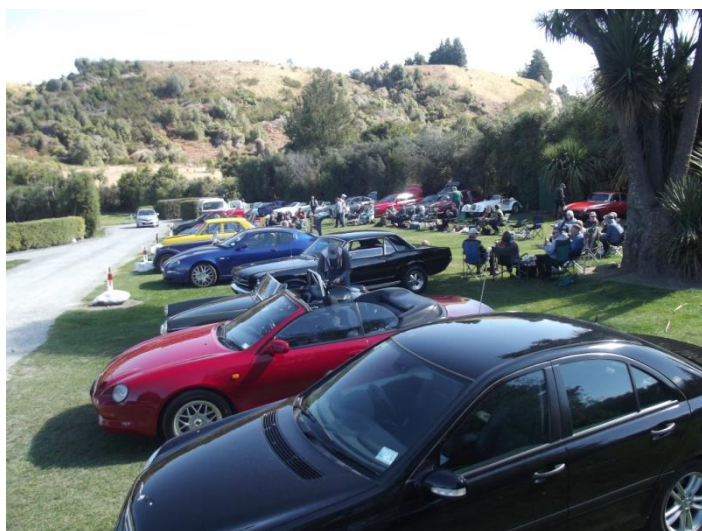
Rakaia Gorge – our group filled the picnic area